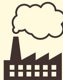
No air pollution (no toxic chemicals and heavy metals)