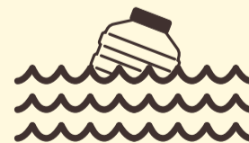
No water pollution