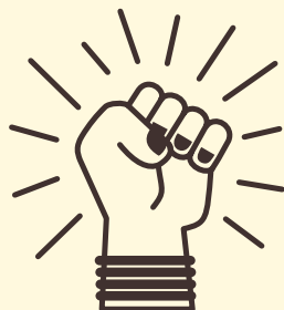
Women empowerment through employment